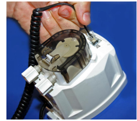
Figure 3. Programmer Installation

Step 7: After the Olympian Unit has been programmed with the desired values, remove the Two Button Programmer from the Olympian programming jack and replace the Olympian cover.